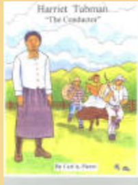
Harriet Tubman "The Conductor" By Carl A. Pierce (click picture to enlarge)